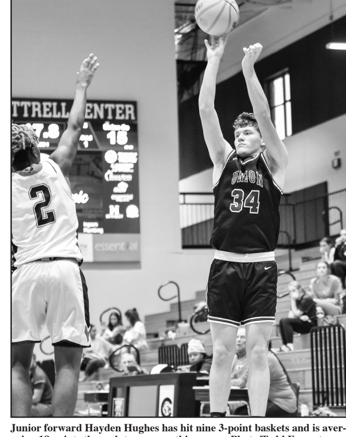
aging 18 points through two games this season.

Panthers 70, Putnam County 73 - The Panthers couldn't protect a 61-46 fourthquarter lead despite Henry's 20 points, 10 assists, 6 rebounds, 5 steals and a block during Sat-